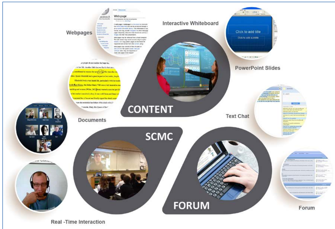
Figure 1, Components of MATL Lesson

When I was appointed MATL Course Director in 2010, I surveyed approximately 30 students on their perceived expectations and experiences of the live online tutorial component of the programme. I noted a lack of student interaction in the tutorials and that the tutor role was often too dominant in such events. The survey revealed that students appeared to have mixed views on the purpose of the events, as captured in Table 1.